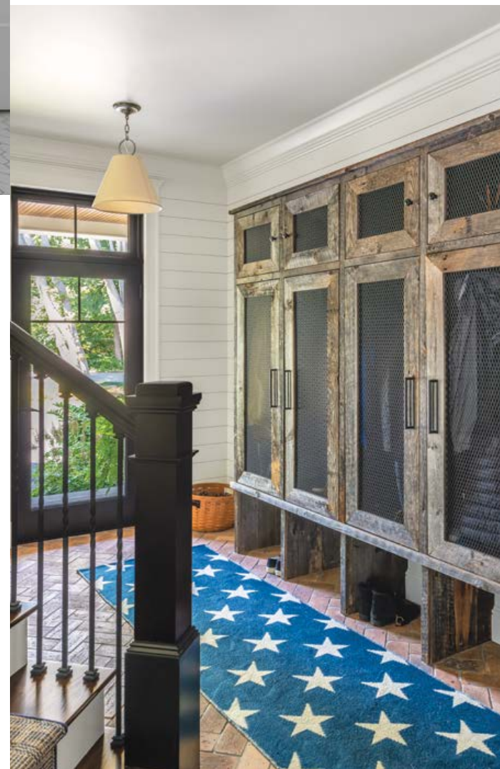
TOP, LEFT: Light fixtures set against wooden beams offer a blend of natural textures. ABOVE: A giant fireplace in the screened-in porch is flanked by handcrafted accoutrements. LEFT: A playful runner lives up the entryway. BELOW: Bedrooms are one space where Marybeth eschewed window treatments in favor of views of the garden.