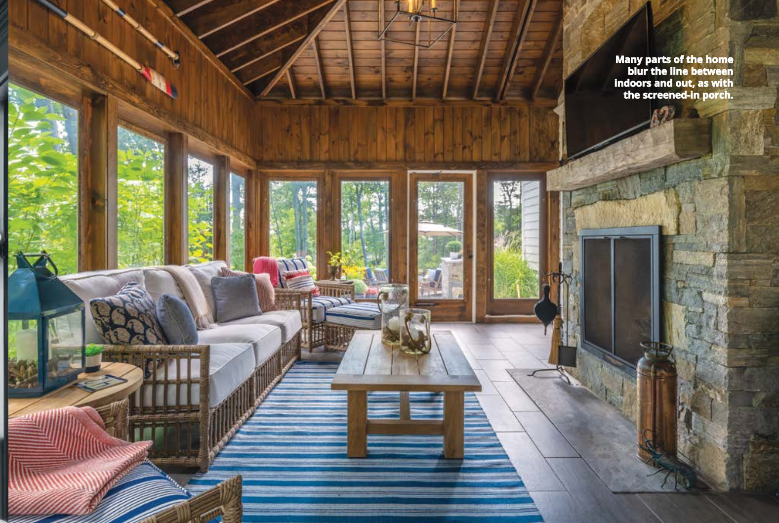
Many parts of the home blur the line between indoors and out, as with the screened-in porch.