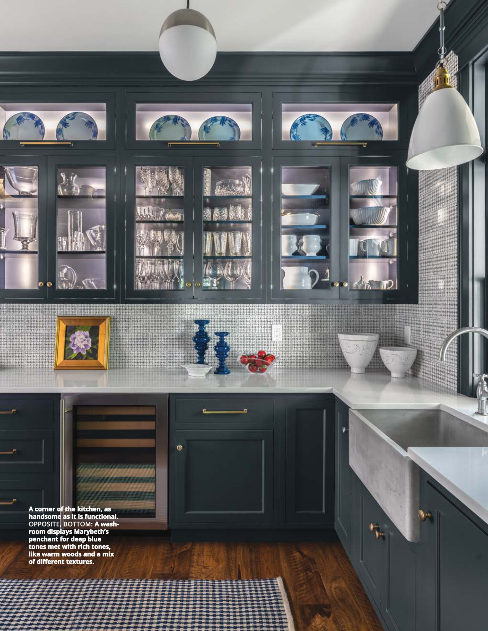
A corner of the kitchen, as handsome as it is functional. OPPOSITE BOTTOM: A wash-room displays Marybeth's penchant for deep blue tones met with rich tones, like warm woods and a mix of different textures.