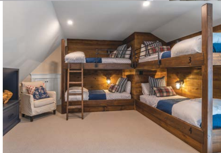
TOP: Marybeth chose blue (but not nautical, she insists) wallpaper as a backdrop to several rooms. LEFT: Greg's hard work in the garden pays off with fresh flowers to decorate the indoors. ABOVE: The couple built separate areas of the house for their grown children to stay in when visiting.