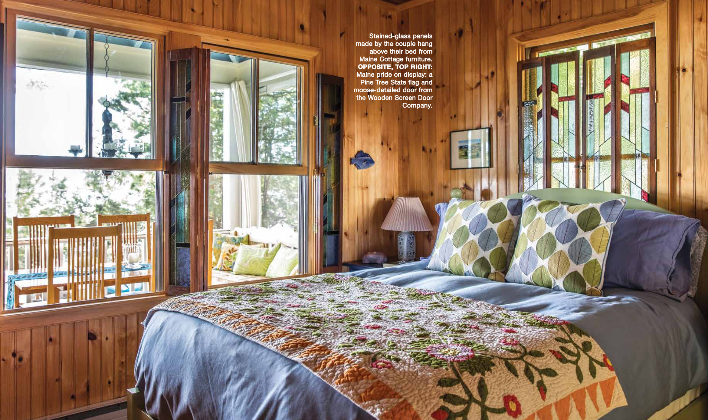
Stained-glass panels made by the couple hang above their bed from Maine Cottage furniture. OPPOSITE, TOP RIGHT: Maine pride on display: a Pine Tree State flag and moose-detailed door from the Wooden Screen Door Company.