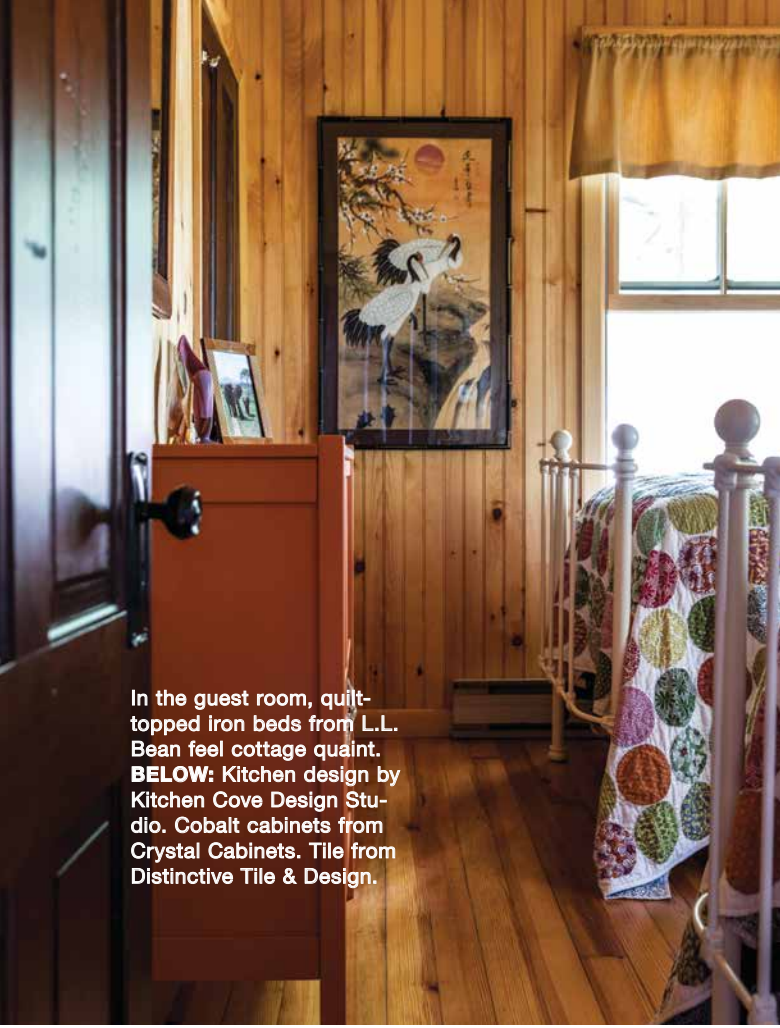
In the guest room, quilt-topped iron beds from L.L. Bean feel cottage quaint. BELOW: Kitchen design by Kitchen Cove Design Studio. Cobalt cabinets from Crystal Cabinets. Tile from Distinctive Tile & Design.

Pond. Some 46 miles wide, it is the largest pond in the Kennebec County Belgrade Lakes region. An ever-popular destination for boaters, fishermen, and holiday seekers, the lake was surrounded by cabins, with a main lodge providing meals and all the conveniences of the day. (An early brochure boasts “Daily mail service, long distance telephone, and telegraph.”) Founded around 1904, it ran as a full-service seasonal camp until the late 1950s, when the cottages were later sold off as private summer residences. Jim and Lee bought in 2013 and have spent the ensuing years making the cottage their own.